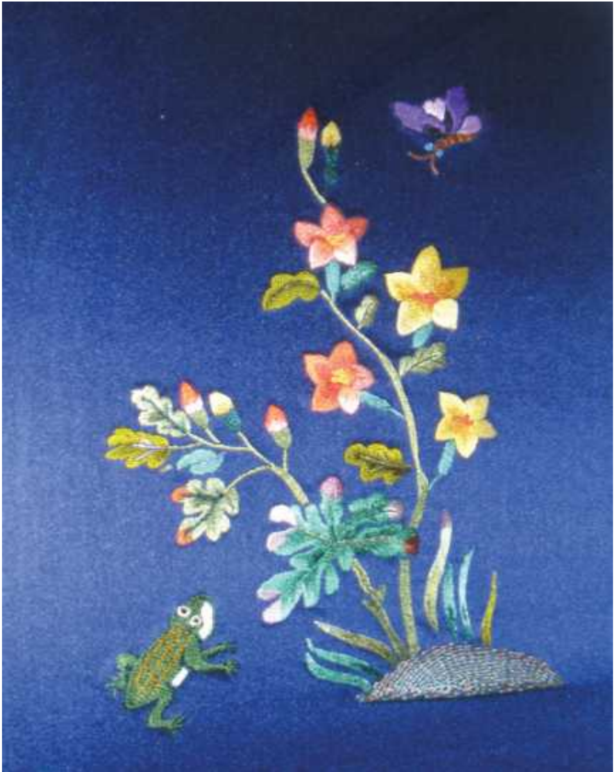
Title: Flowers and a flog Dimension: 6.6 x 4.7 inches Year created: 2014 Material: Silk fabric, silk threads Technique: Hand-embroidered