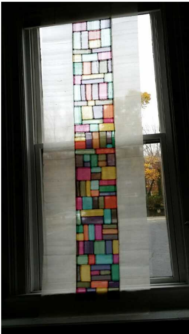
Title: Bojagi table runner Dimension: 11.8 X 78.7inches Year created: 2011 Medium: See-through silk fabric, Silk thread,